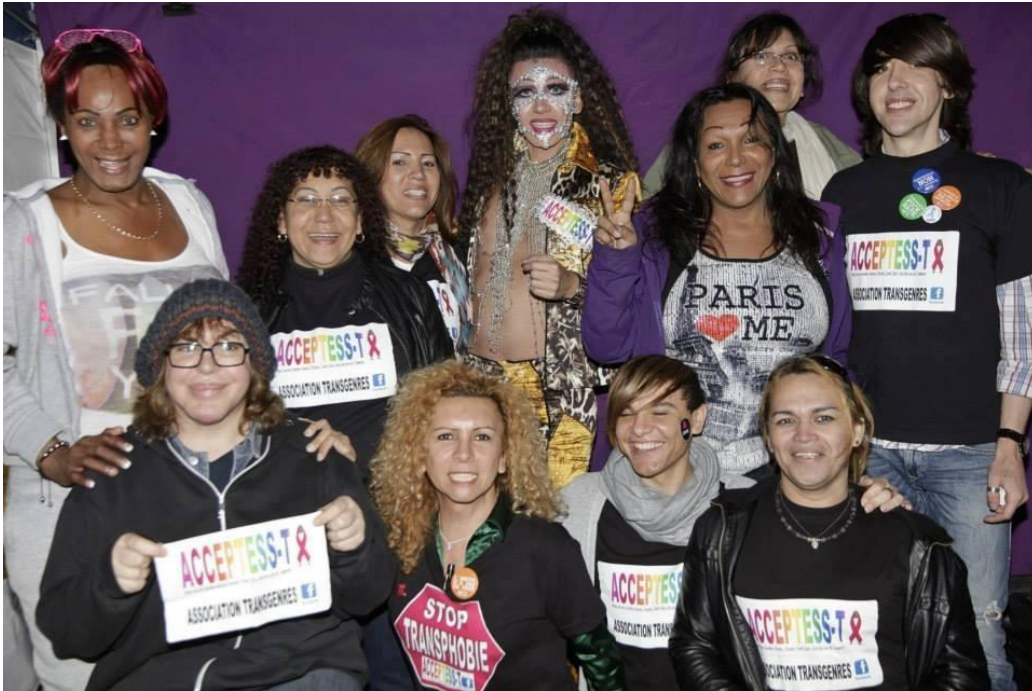
An action undertaken by French trans activists on the International Day against Homophobia & Transphobia in Paris on 17 May 2013, © ACCEPTESST

amendments were in line with the recommendations of the National Advisory Commission on Human Rights and aims at introducing a framework allowing transgender people to obtain legal gender recognition without requiring evidence of medical treatments.