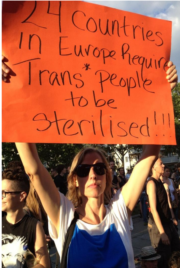
Trans*genious Pride 2013 in Berlin

As a result of the case law of the Constitutional Court, the conditions currently required to access the minor solution and the major solution are very similar.