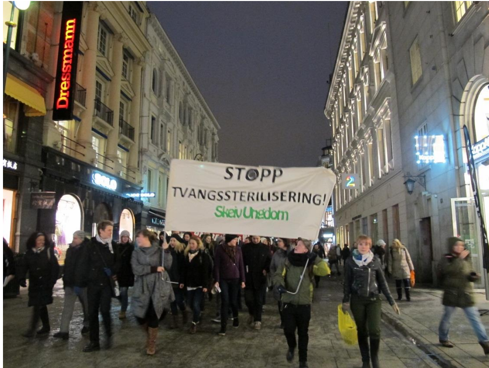
Demonstration against sterilisation in Norway. The banner reads “Stop forced sterilisation”, March 2012

mechanism to which transgender people who are denied health services from the OUS can apply. 207 The Directorate of Health has established an expert group, composed of health professionals, legal experts and representative of transgender organizations. The group is tasked to develop recommendations on legal gender recognition and access to health care for transgender people by 31 January 2015.