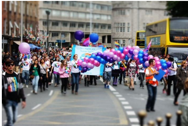
Transgender Equality Network Ireland (TENI) participates at Dublin Pride Dublin 2012

The 1989 Prohibition of Incitement to Hatred Act forbids actions, broadcasting, and possession and distribution of materials that “are likely to stir up hatred” on grounds of race, religion, nationality or sexual orientation. 160 However, there is no specific legislation in Ireland to ensure that any alleged hate motive associated with a crime is thoroughly investigated and taken into account in the prosecution of suspects. Statistics on hate crime are collected by the police and published by the Central Office for Statistics (CSO). Disaggregated data are available on a number of grounds including race, ethnicity, sexual orientation and citizenship but not on gender or gender identity. 161