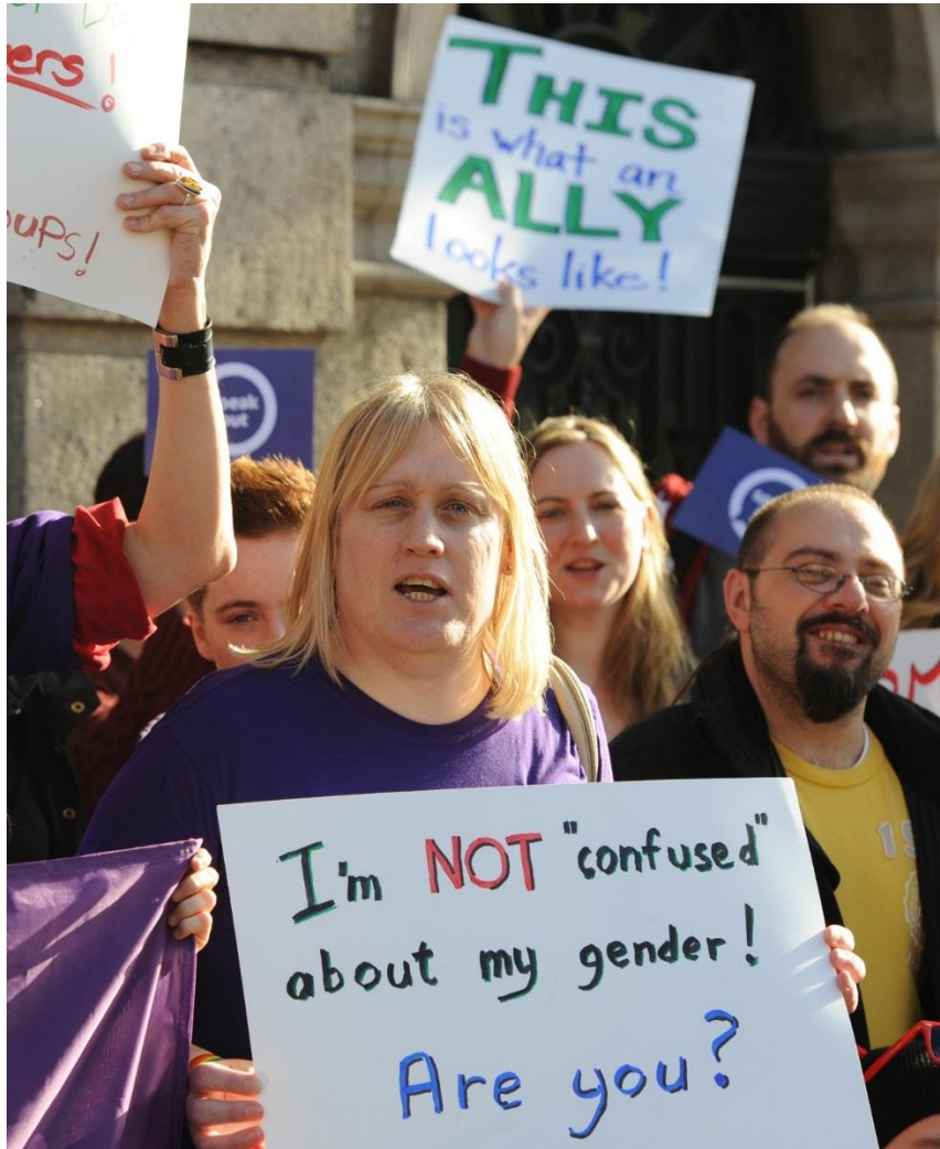
Demonstration for gender legal recognition outside Leinster House in Dublin October, 2012

human rights. For that purpose, legal gender recognition should not be made contingent on psychiatric diagnosis, medical treatments, single status or blanket age requirements.