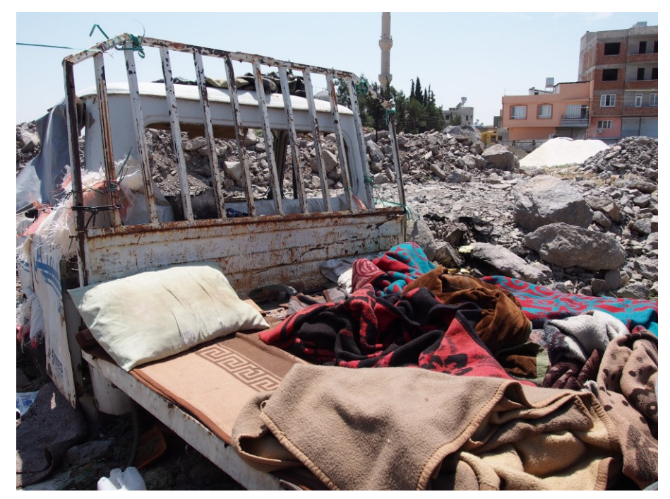
At a construction site in the city of Kilis, in which some 60-70 Syrian refugees were living, some – as pictured – with no shelter of any kind.