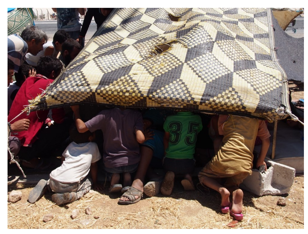
Turkey's government-run camps accommodate over 220,000 Syrian refugees, but they are operating at full capacity. Pictured is a makeshift shelter outside the refugee camp in the town of Akçakale, in and around which 150-200 refugees from Syria were living, in the hopes of entering the camp.