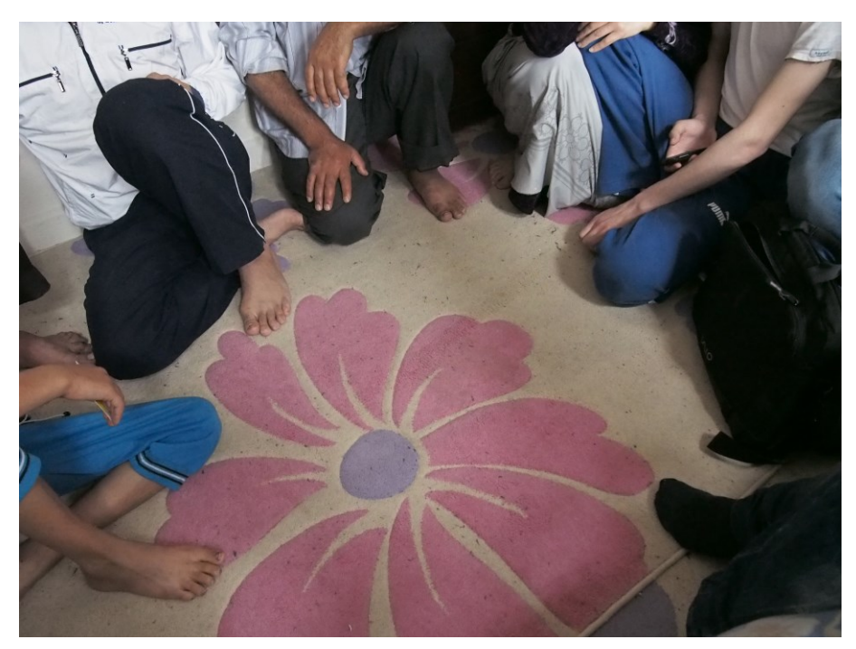
One half of an extremely small two-room apartment in Istanbul, in which twelve refugees from Syria were living.