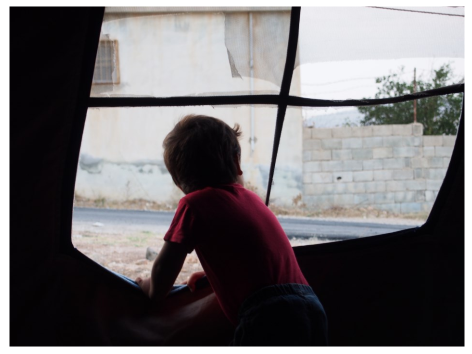
A three and a half-year old boy in the city of Kilis, looking out from his home – a tent by the side of the road, in which his family has been living for over two years, ever since his family fled from Syria.