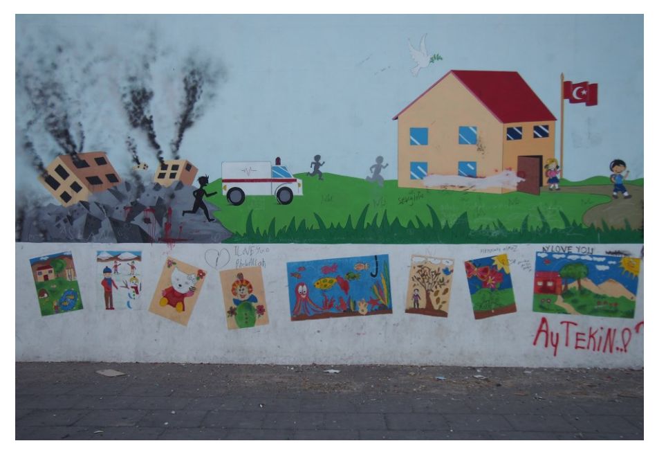
A section of the schoolyard mural painted by teachers at the Syrian School in Kilis. The school, which over 2,000 Syrian refugee students attend, is operated in partnership with the municipality and international donors.