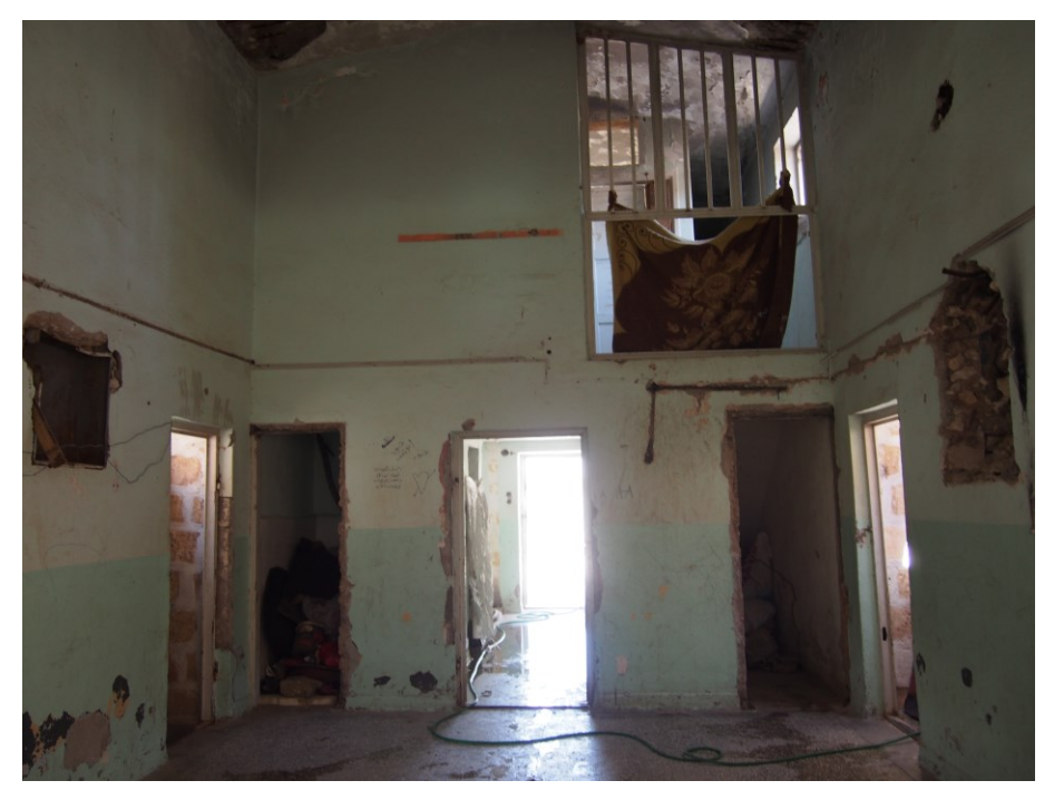
An abandoned prison in the town of Akçakale, in and around which some two dozen refugee families from Syria had been living for eight or nine months, ever since their savings ran out and they could no longer afford to pay rent.