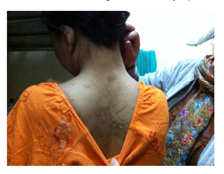
An Indonesian former domestic worker shows researchers the marks on her body that she said were inflicted by her employer.