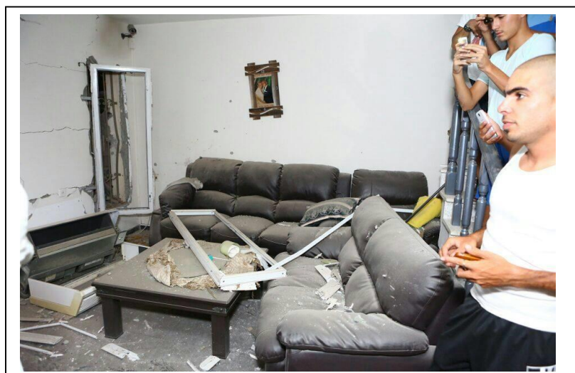
House in Be'er Sheva hit by a rocket fired from the Gaza Strip, 10 July, 2014.

In general, Amnesty International was unable to determine any possible targets of Palestinian rockets and mortars fired during the conflict, due to the fact that Palestinian armed groups did not specify their targets in many cases, as well as the lack of publicly available information on the precise location of military targets in or near Israeli urban areas. Military objectives are located in close proximity to civilian areas in many parts of Israel. The