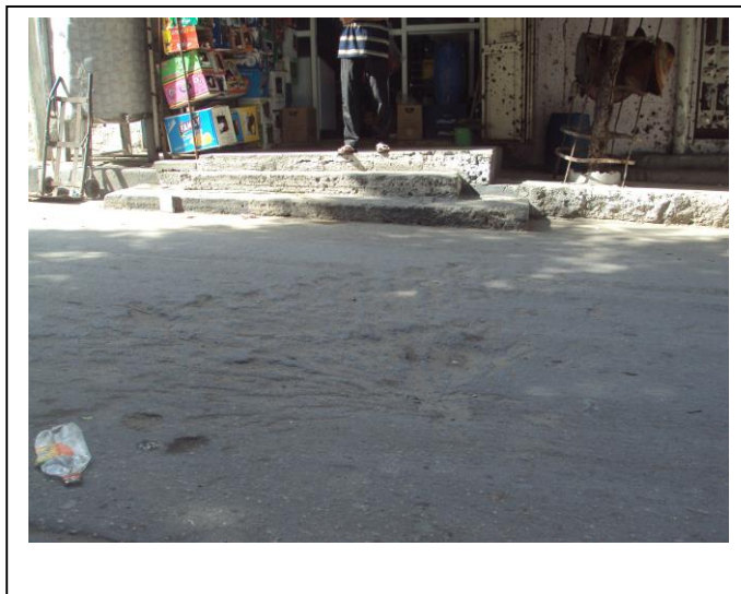
Picture of the impact made when a rocket fired by an armed Palestinian group aimed at Israel fell short and hit a street in the al-Shati refugee camp, north-west of Gaza City on 28 July 2014. The attack killed 11 children and two adults.

people were wounded, most of them children, according to the Ministry of Health in the Gaza Strip.