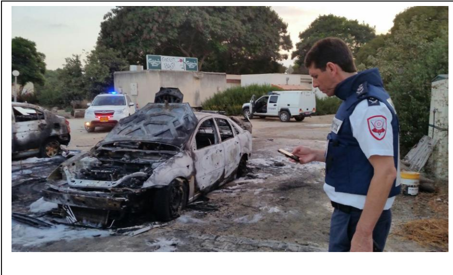
Israeli rescue workers at the scene of a rocket attack from Gaza which hit a kibbutz near the border with Gaza on 22 August 2014.