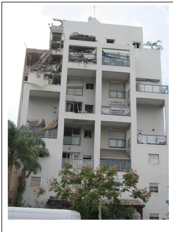
Damage to apartment buildings in Rishon LeZion caused by a rocket fired on 20 November 2012 from the Gaza Strip, during the eight-day Israel/Gaza conflict.

and Egypt. 5 During Operation Protective Edge, the al-Qassam Brigades claimed to have fired R-160 rockets, a locally produced version of the M-302, also with a range of 160km. 6