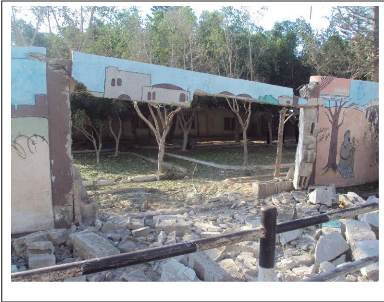
Damage to the outpatients' clinic of al-Shifa hospital in Gaza City on 28 July 2014, which evidence suggests was caused by a rocket attack by an armed Palestinian group that was aimed at Israel but fell short.

of those killed were standing in or near the doorway of the shop. Mahmoud described what happened after the explosion: