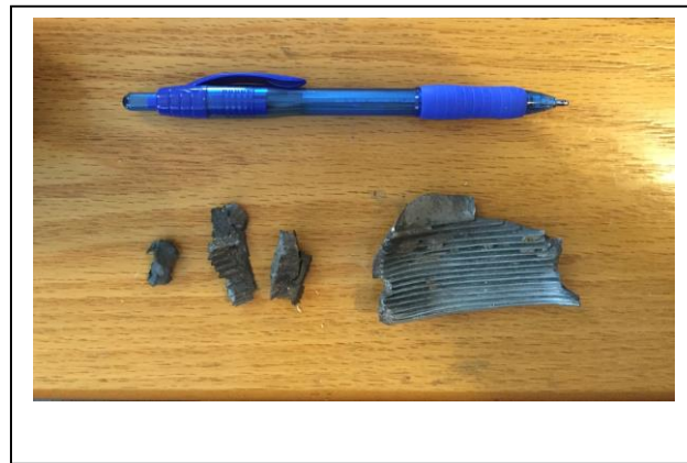
Shrapnel from the scene of the attack on Kibbutz Nirim on 26 August 2014.