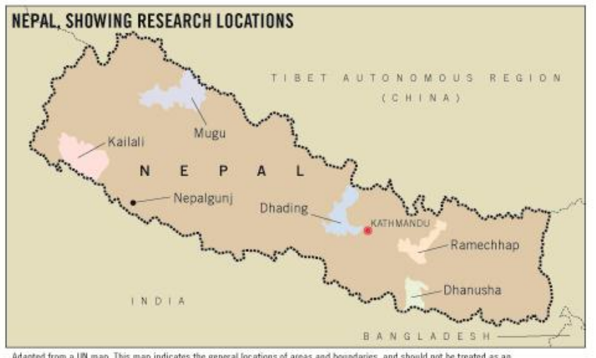
Adapted from a UN map. This map indicates the general locations of areas and boundaries, and should not be treated as an authoritative description of the area or interpreted as Ampesty International's view on questions of borders or disputed areas.

The main field research was conducted during a third visit in April and May 2013 when Amnesty International researchers visited four districts – Kailali, Mugu, Ramechhap and Dhanusha – and Nepalgunj city. These districts were selected to ensure information was gathered from different regions (far western, mid-western and central) and geographical terrain (mountains, hills and Terai - or plains) in order to assess if women and girls in these different areas are experiencing similar human rights violations and patterns of gender discrimination. Amnesty International planned to visit Siraha in the eastern Terai; however, a bandh (protest involving in road blocks on the highway to Siraha) meant the delegation had to cancel the visit and, at very short notice, make arrangements to conduct interviews in the neighbouring district of Dhanusha instead.