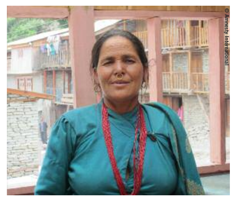
"When I gave birth during the monsoon season I... could only rest for one week, then I had to dig the fields and plant the crops."

right: Women agricultural workers in Mugu district, May 2013. Domestic violence, including marital rape, is common in Nepal. Women who have uterine prolapse sometimes experience more violence because of their condition. Although there are laws against domestic violence and marital rape, many women are either unaware of them or feel powerless to complain.