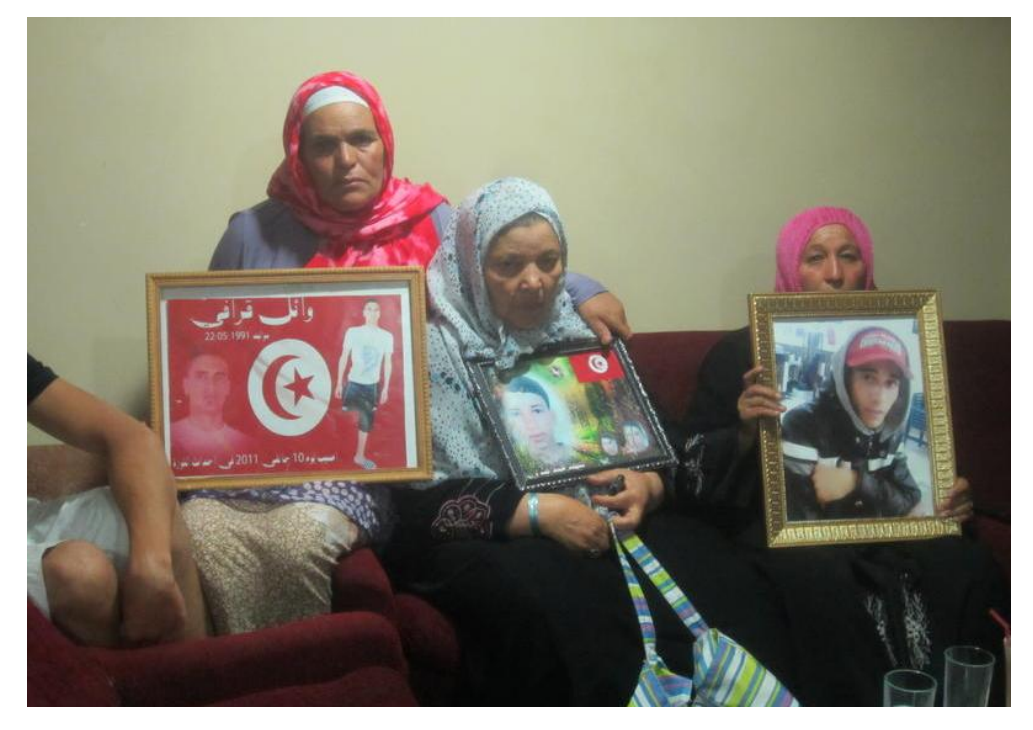
Mothers of those injured or killed during the 2011 uprisings in Kasserine

The mass demonstrations in December 2010 and January 2011 that led to Ben Ali's flight from Tunisia on 14 January 2011 were met by serious human rights violations by the security forces. According to the National Fact Finding Commission on Abuses Committed from December 17, 2010 to the End of its Mandate (Commission nationale d'établissement des faits sur les dépassements commis entre le 17 décembre 2010 et la fin de son mandat), headed by Taoufiq Bouderbala and mandated to investigate human rights violations during the uprisings, 338 people were killed in the weeks before and the days immediately after Ben Ali's departure, and more than 2,000 people were injured, some seriously.