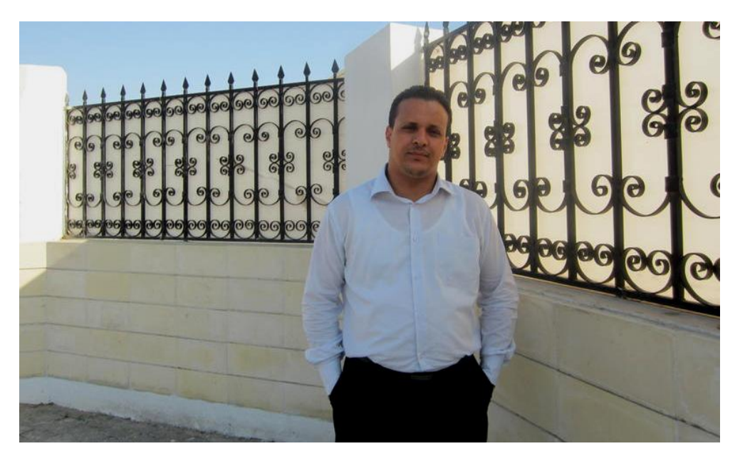
Ayoub Massoudi