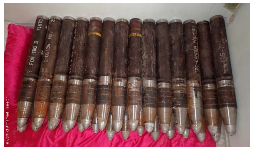
Improvised ground-to-ground rockets manufactured by IS forces and captured by Syrian Kurdish People's Protection Units in Kobane, documented by a Conflict Armament Research Field Investigation team on 21 February 2015 in Kobane.