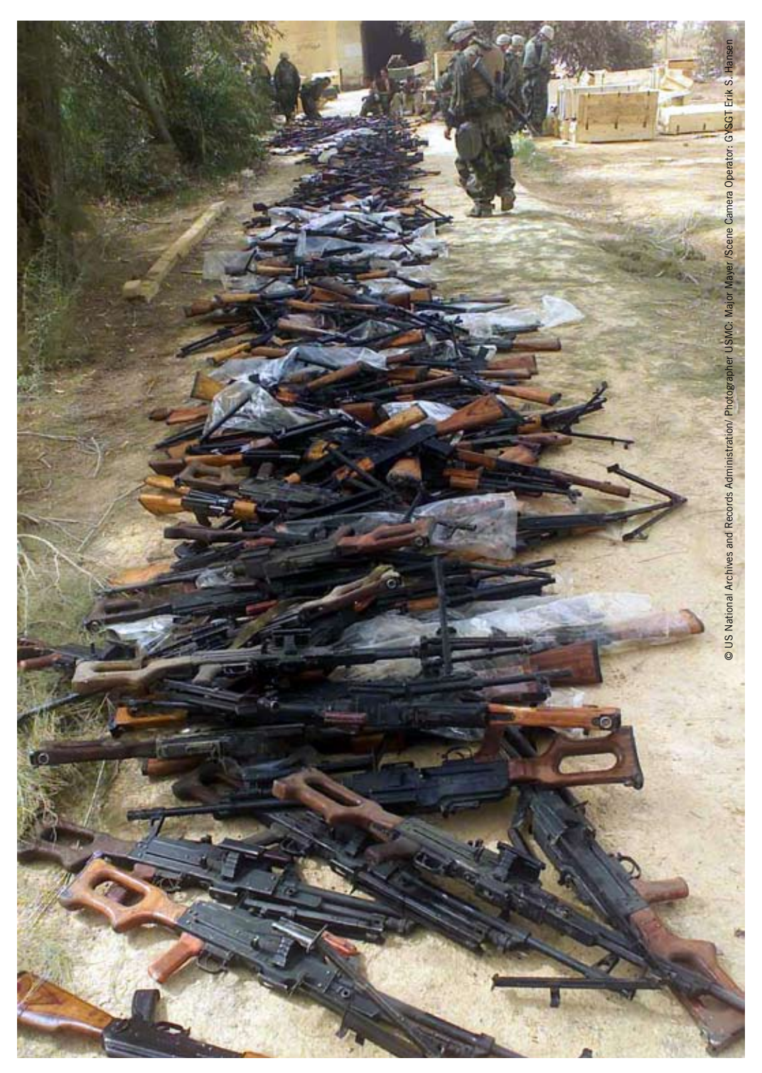
Captured weapons cache containing hundreds of Russian Dragunov automatic rifles, outside of Jaman Al Juburi, April 2003.

More than one third of soldiers and marines reported that torture should be permitted to save the life of a fellow soldier or marine, and less than half said they would report a team member for unethical behaviour. ^{105} These findings were largely replicated in another survey in September and October 2007.106