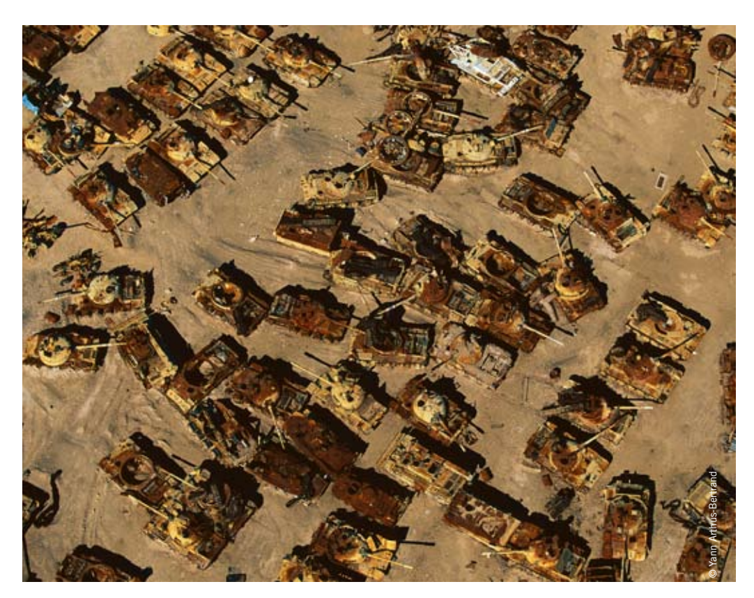
Iraqi tank junkyard in the desert near Al-Jahrah, Kuwait, January 1991.

President Hussein built up an indigenous arms industry, producing small arms and ammunition, modelled on the Russian AK series, Russian T-72 tanks under licence, howitzers, anti-tank grenade launchers (RPG-7) and Beretta-type pistols. According to Jane's Sentinel Security Assessment, by 1990 the country "was largely self sufficient in the production of small arms ammunition, rocket propelled grenades (RPG) [sic], mortar and artillery shells and aircraft bombs".85