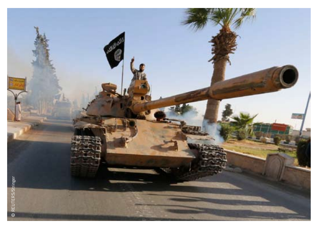
Islamic State fighters take part in a military parade in a captured T-55 tank along the streets of northern al-Raqqa province, Syria, 30 June 2014.

Additionally, during the current conflicts in Syria and Iraq, IS has captured hundreds of light armoured fighting vehicles of more than a dozen different types that were in service with the Syrian and Iraqi armies. However, the vast majority of light armoured fighting vehicles used by IS fighters comprise only a few models: the Russian BMP-1, MT-LB Infantry Fighting Vehicle, and the US M113A2 Armoured Personnel Carrier, M1117 Armoured Security Vehicle, and up-armoured HM-MWV (Humvee) variants.