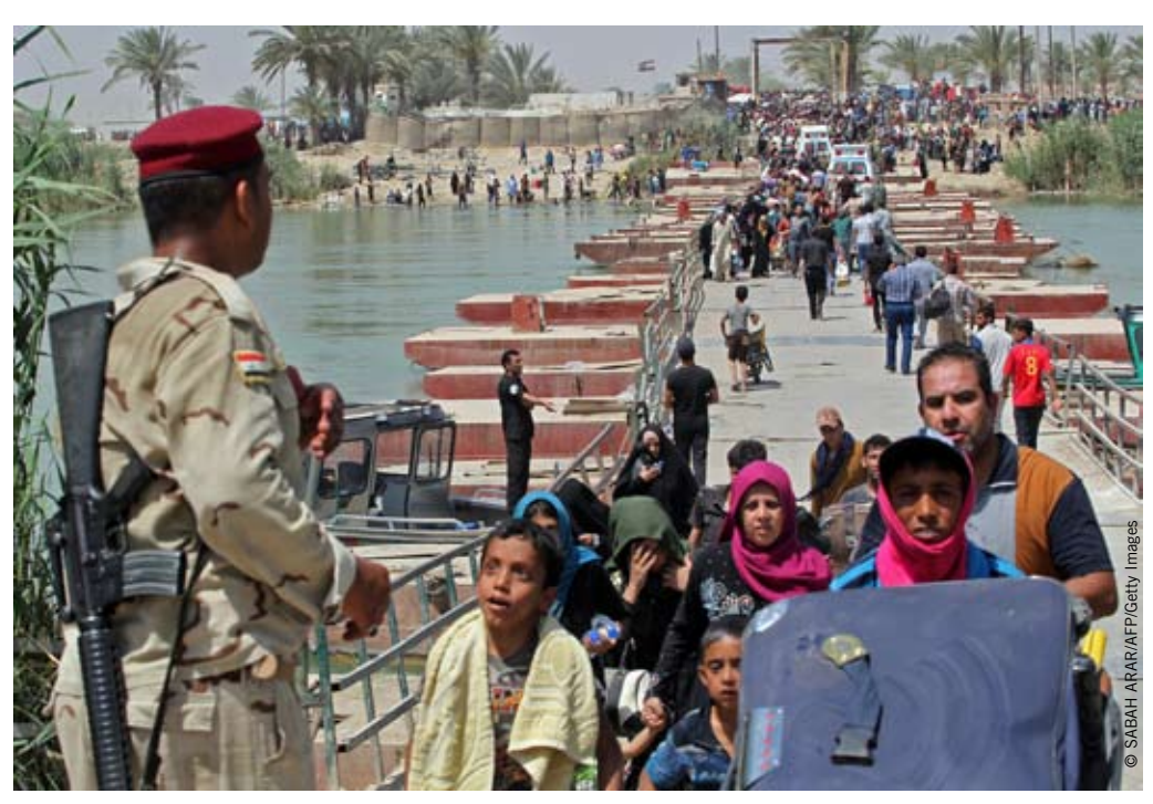
Residents from Ramadi, displaced by IS' capture of the city, wait to cross Bzeibez bridge on the southwestern frontier of Baghdad, May 2015.

entered Iraq with private security companies during the US occupation and found their way into Iraqi arms markets.<sup>49</sup>