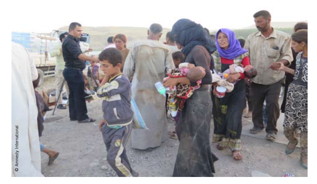
Yezidi internally displaced people arrive in Feshkhabour, Iraq, having fled Mount Sinjar after a week under siege from IS, August 2014

While much of the violence pitted Shi'a militias against Sunni armed groups, in 2008 Amnesty International reported further gross human rights abuses including the targeting of religious and ethnic minorities and others including "Yazidis, Christians, Sabeans and Palestinians... women, human rights defenders, judges, medical doctors and other professionals". 136 More recently, in 2014, Amnesty International documented Shi'a militia groups' systematic abductions and killings of Sunni civilians in Iraq, amounting to war crimes. The Shi'a militia groups were often armed and supported by the Iraqi military, and operating with their tacit support. 137