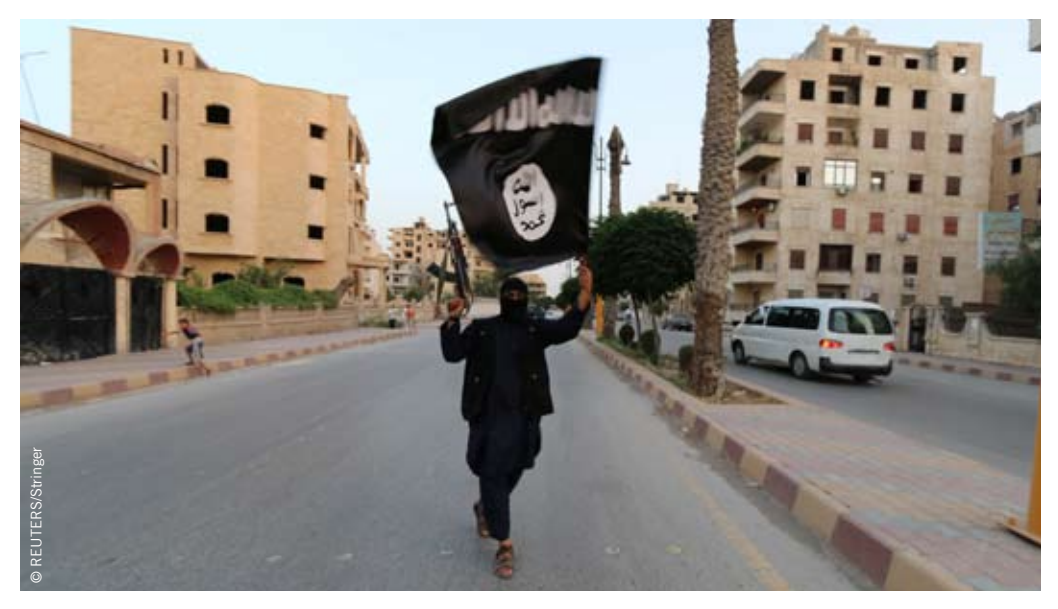
IS fighter waves the IS flag in al-Raqqa, Syria, June 2014.

After a brief summary of IS' formation and subsequent expansion, this chapter describes the arsenal of the armed group which has allowed it to maintain its control over parts of Iraq and Syria and commit crimes under international law.