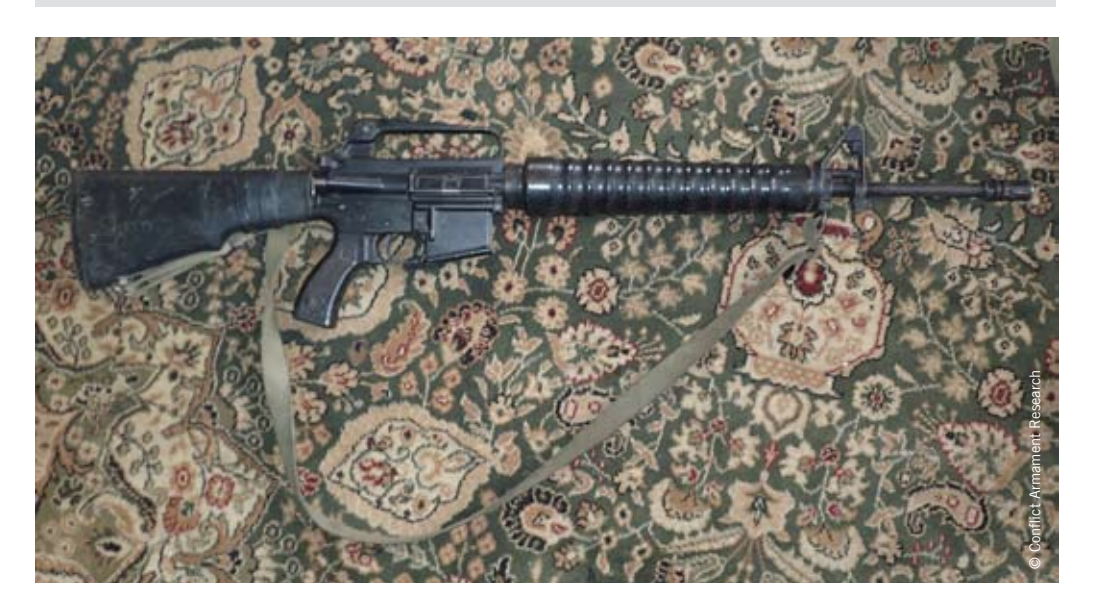
Chinese CQ 5.56mm rifle captured from IS forces by Syrian Kurdish People's Protection Units during the siege of Kobane and documented by a Conflict Armament Research field investigation team on 24 February 2015 in Kobane.

In February 2015, Conflict Armament Research documented two Chinese CQ 5.56mm rifles which had been captured from IS fighters by Kurdish People's Protection Units fighters. The rifles had had their serial numbers ground off and painted over with black paint; they were loaded with Chinese ammunition manufactured in 2008. Exactly the same configuration – from the removed serial numbers to the black paint and 2008 Chinese ammunition — had previously been observed by Conflict Armament Research and Small Arms Survey researchers in relation to Chinese CQ rifles identified in South Sudan among rebel forces in 2013.66