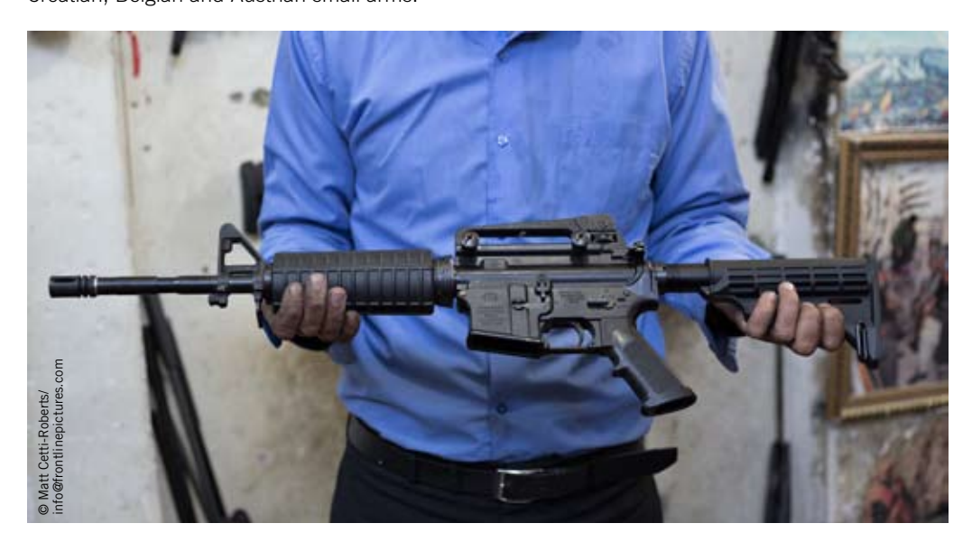
A Kurdish gunsmith holds a US-made M16A4, previously in the possession of the Iraqi army, and later IS, after the weapon was converted in to an M4 carbine-type rifle. Erbil, September 2014.

The main rifle type used by IS is the AK (Avtomat Kalashnikov) family of automatic rifles, as well as close copies and derivatives, with a bias towards the Russian and Chinese types that have been the staple of the Iraqi army for decades. Most of these weapons are decades old, though the more modern Russian AK-74M is in evidence, most probably looted from Syrian army stocks. IS forces have also captured US-manufactured small arms, including M16 assault rifles, along with Chinese, Croatian, Belgian and Austrian small arms.<sup>9</sup>