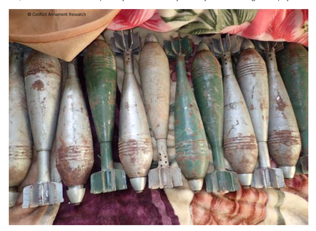
Improvised mortar rounds manufactured by IS forces and captured by Syrian Kurdish People's Protection Units documented by a Conflict Armament Research Field Investigation team on 21 February 2015 in Kobane.

IS captured an unknown quantity of 155mm M198 towed howitzers from Iraqi military stocks during its capture of Mosul in June 2014, along with the older Chinese Type 59-1, which the Iraqi army used extensively during the 1980-1988 Iran-Iraq war.<sup>23</sup> IS has also captured former Soviet Union D-30 and M-30 122mm howitzers from Syrian military stocks and small numbers of the older, and now obsolete, M-30 models which were probably taken from the Syrian army's reserve storage for deployment.