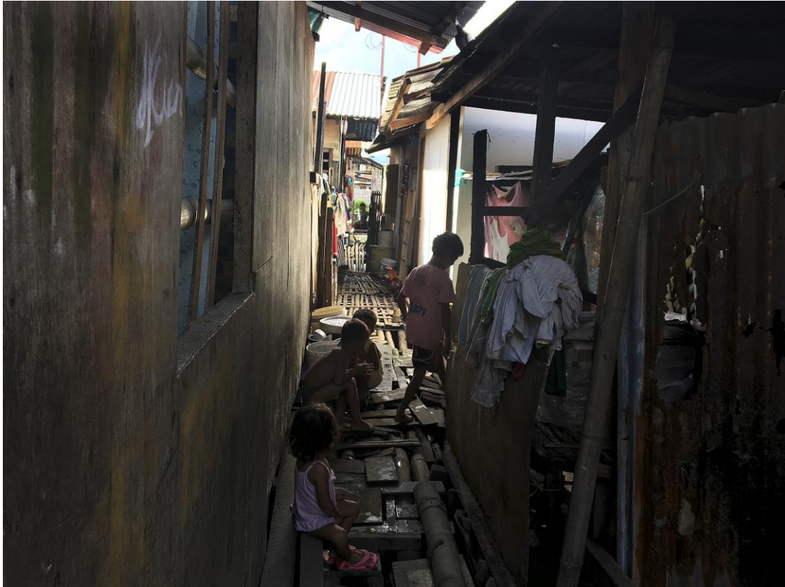
Children play, 8 December 2016, in a floating slum (exact location withheld) where one of the cases of killings by police documented by Amnesty International in Cebu Province took place. Many of the people who have been targeted in the anti-drugs campaign are poor.