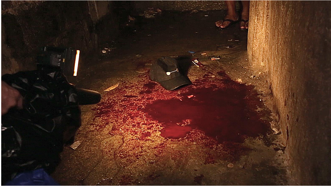
A pool of blood is filmed by a cameraman following a killing on 12 December 2016, Caloocan City, Metro Manila. The killing in a police “buy-bust” operation was one of two cases documented by Amnesty International delegates observing journalists’ night-shift coverage of police activities. Screenshot, © Amnesty International (photographer Alyx Ayn Arumpac)

Of the 33 drug-related killings documented by Amnesty International, 20 occurred during formal police operations. The vast majority appear to have been extrajudicial executions.