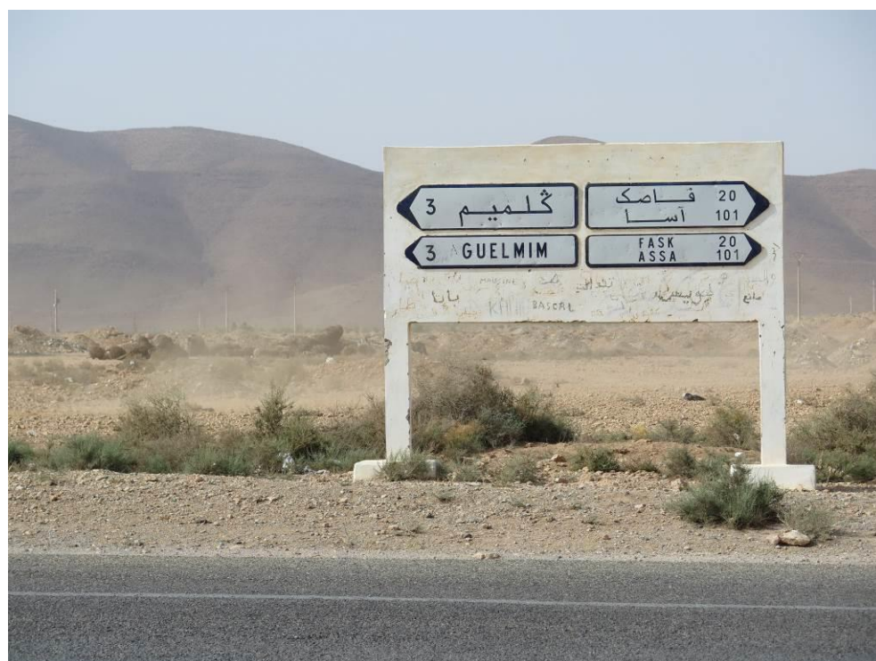
Photo: Junction between Guelmim and Assa, southern Morocco, where reports of protesters being tortured and otherwise ill-treated following arrest by gendarmes and police in September 2013 emerged.

“He was full of bruises. He told me they tortured him the night he was arrested, until he signed, although he was innocent. When he resisted signing, they threw water on him and gave him electric shocks. We went to the police station at the time, but they wouldn’t let us see him.”