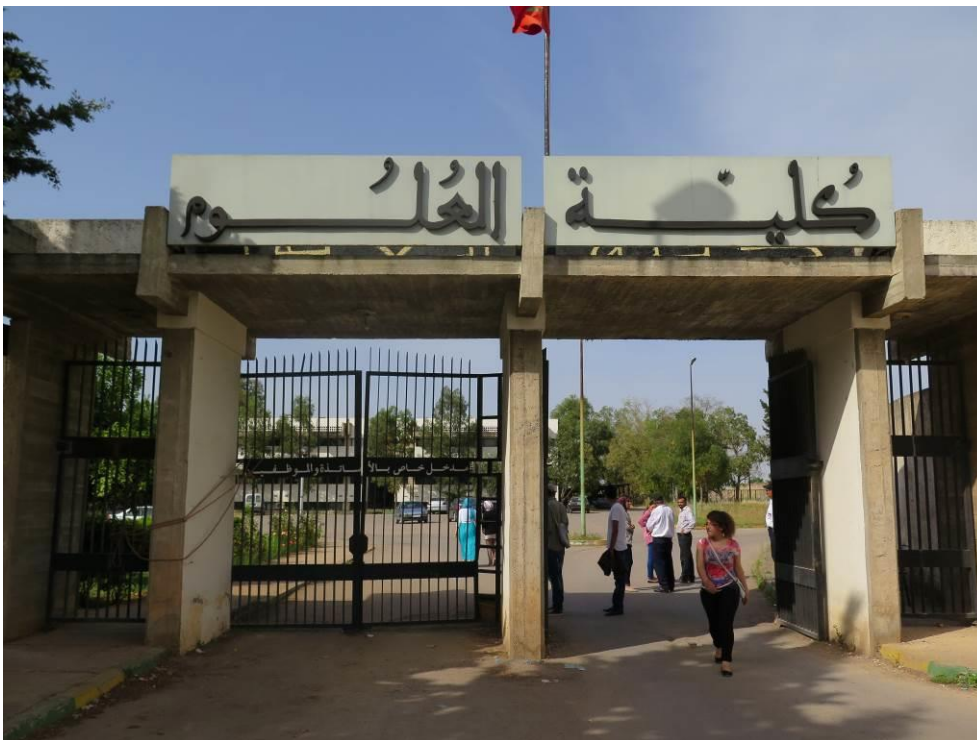
Photo: Science Faculty, Dhar El Mehratz campus, Sidi Mohamed Ben Abdellah University in Fes