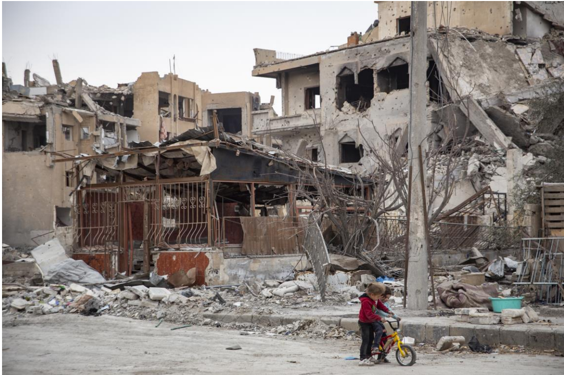
Children riding a bicycle among destroyed buildings in Raqqa.

aware of any Coalition investigators having visited any strike sites anywhere in the city or having interviewed survivors or witnesses of other strikes. Such shortcomings in the investigation methodology appear to be a significant contributing factor to its dismissal of almost all the reports of civilian fatalities and casualties. 122