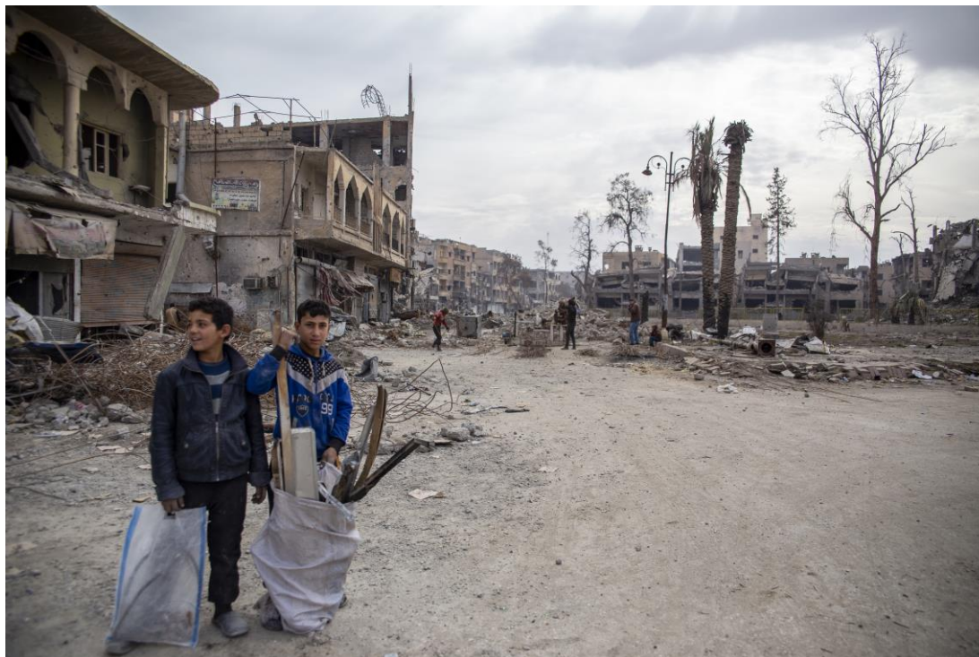
Children scavenging for scrap metal in the rubble of destroyed buildings in Raqqa, where many of the buildings were mined by IS and where children and adults are frequently killed and injured by mines.

Daily labourers and scavengers are sometimes referred to as “unofficial de-miners” because they risk their lives working in the rubble of bombed-out buildings which may be mined. A local businessman told Amnesty International: