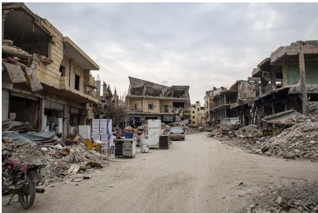
A shop selling household goods in the midst of destroyed buildings in Raqqa. Many business people, complain that their shops and warehouses were looted after they left the city.

back to Raqqa immediately after the battle but the SDF did not allow residents back then because they said there were mines planted by Daesh. But now, after everything has been looted, residents are allowed to come back even though there are still mines everywhere and people get blown up every other day by these mines. 140