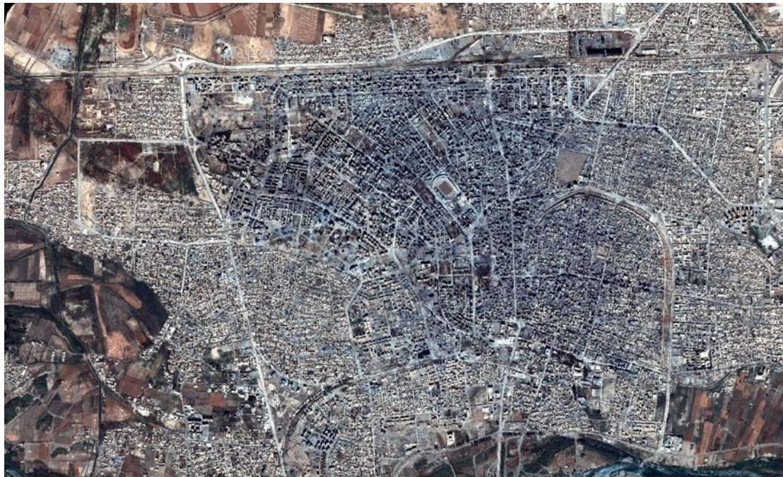
Raqqa's overview, 16 October 2017.

Amnesty International's field investigation carried out in Raqqa after the end of the military operation confirmed the concerns raised in its previous report. The four emblematic cases detailed in this report illustrate a wider pattern, which manifested itself throughout the military operation, as the Coalition neglected to address concerns about civilian casualties raised at the outset. That neglect has continued, with the Coalition failing to adequately investigate and provide reparation, and to provide humanitarian assistance commensurate with the scale of destruction caused.