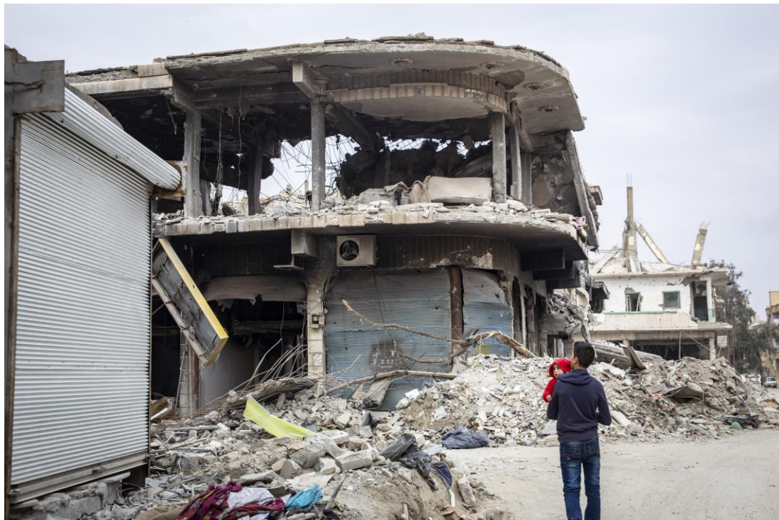
A young man holding a child staring at the ruins of bombed buildings in Raqqa.

Seven were killed and the rest were injured. Most of the dead and injured were women and children. The survivors had no option but to return home. A few days later a Coalition air strike destroyed their home, killing nine members of the family, mostly women and children.