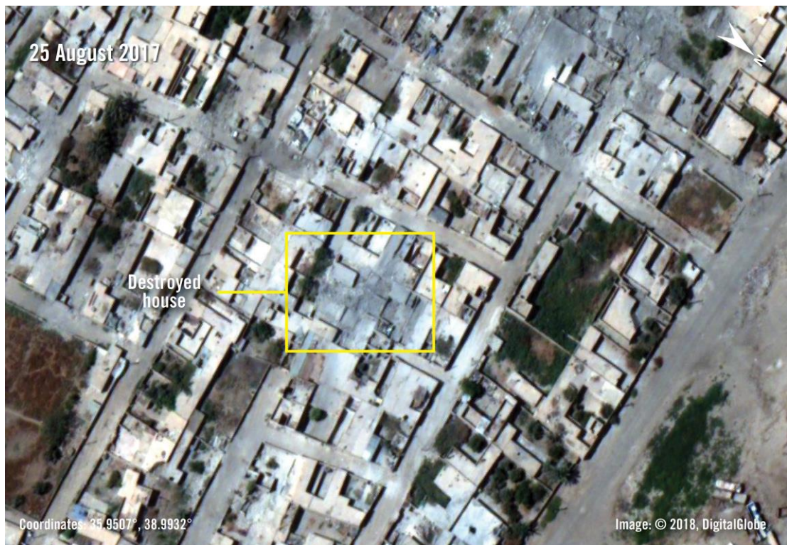
Satellite images showing the house where nine members of the Hashish family were killed in a Coalition strike, before and after the strike.