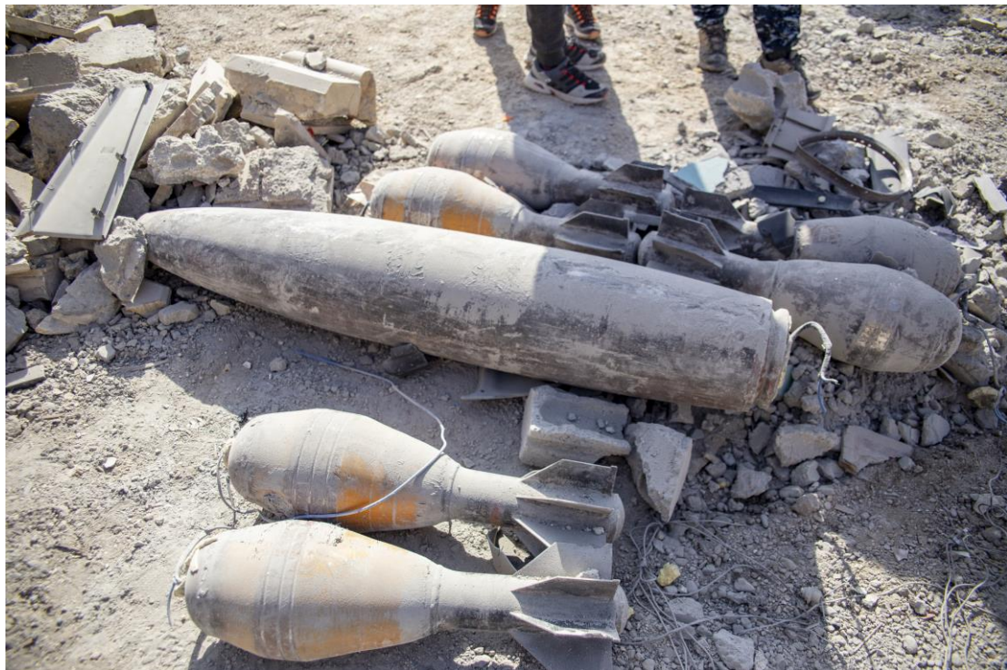
Unexploded MK 82 bomb dropped by the Coalition, which was subsequently rigged by IS and turned into a large IED, surrounded by six mortars locally produced by IS.