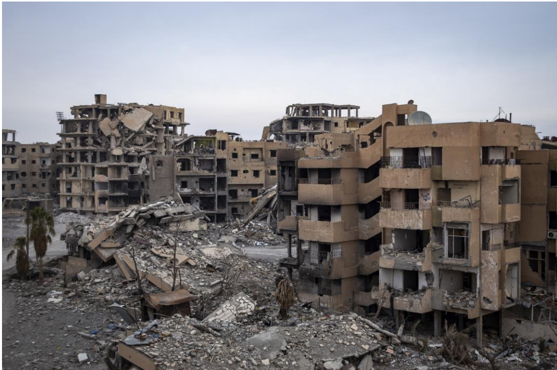
Entire neighbourhoods in Raqqa are damaged beyond repair.

In all the cases detailed in this report, Coalition forces launched air strikes on buildings full of civilians using wide-area effect munitions, which could be expected to destroy the buildings. In all four cases, the civilians killed and injured in the attacks, including many women and children, had been staying in the buildings for long periods prior to the strikes. Had Coalition forces conducted rigorous surveillance prior to the strikes, they would have been aware of their presence. Amnesty International found no information indicating that IS fighters were present in the buildings when they were hit and survivors and witnesses to these strikes were not aware of IS fighters in the vicinity of the houses at the time of the strikes. Even had IS fighters been present, it would not have justified the targeting of these civilian dwellings with munitions expected to cause such extensive destruction.