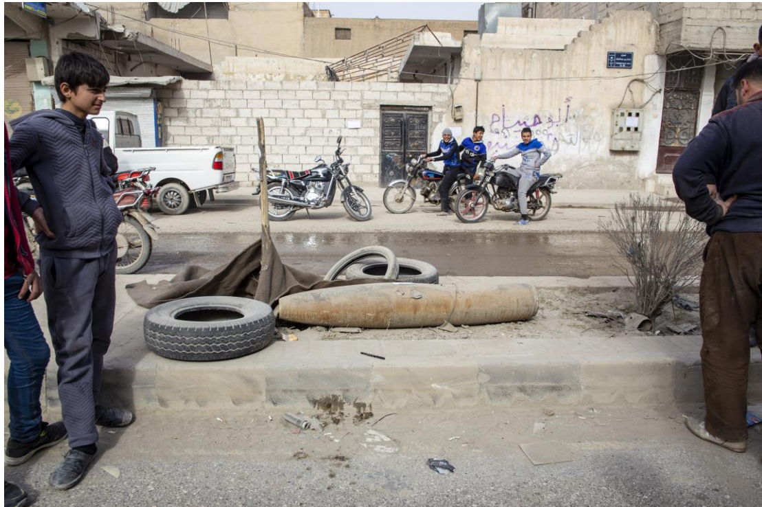
Unexploded MK 82 bomb, dropped by the Coalition, in a street in the centre of Raqqa. Months after the recapture of Raqqa unexploded munitions still littered Raqqa, in places where they posed a threat to civilians and where they could have easily been removed.