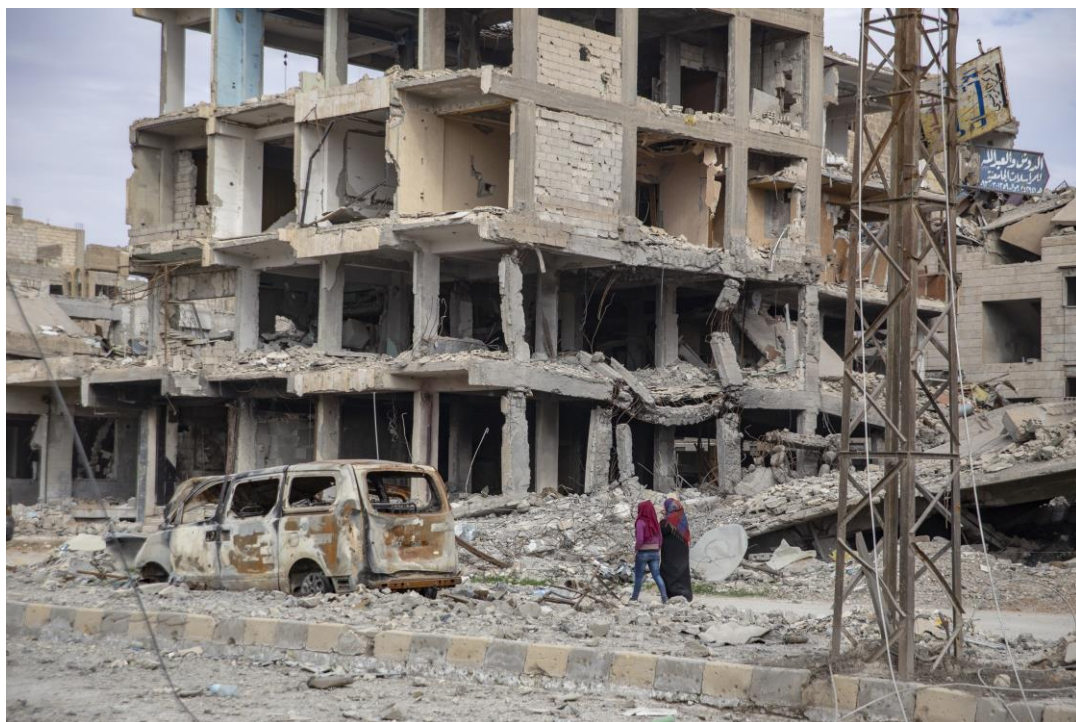
Women walking in rubble-strewn street past destroyed buildings in Raqqa.

Amnesty International’s August 2017 report also detailed IS abuses against civilians during the battle for Raqqa, particularly IS’s use of civilians as human shields as the conflict got underway and the group redoubled efforts to prevent residents from leaving the city. IS laid mines/IEDs to slow advancing SDF forces and to render exit routes impassable, 7 set up checkpoints around the city to prevent residents from leaving, and its snipers shot and deliberately killed civilians who tried to escape. 8 As the SDF captured neighbourhoods and front lines shifted within the city, IS forced residents to move deeper into areas which remained under its control.