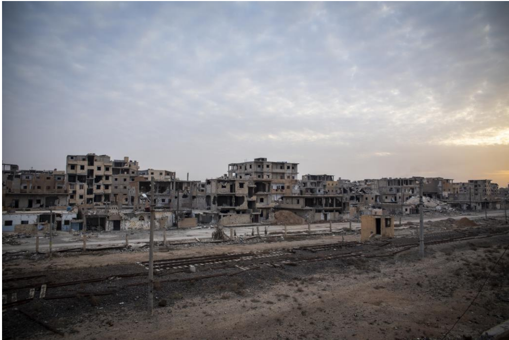
Destroyed neighbourhood in Raqqa.

strikes, at the time that the military operation was still under way. 105 A Coalition official dismissed the concerns raised by Amnesty International and by the UN Special Advisor on Syria, who had called for a pause in hostilities to allow civilians out of the city. 106 The Commander of Coalition forces, Lieutenant General Stephen Townsend acknowledged that, after an escalation in attacks, “it is logical to assume there has been some increase in civilian casualties” , before going on to cast doubt over Amnesty International’s findings, saying, “I would ask someone to show me hard information.” 107 He further stated: “I think we are being as careful as we need to be and as we can be, and I would challenge the individual from the UN who made this hyperbolic statement that civilian casualties are staggering. Show me some evidence of that.” 108 US Defense Secretary James Mattis’ only response was: “We are the good guys and the innocent people on the battlefield know the difference.” 109