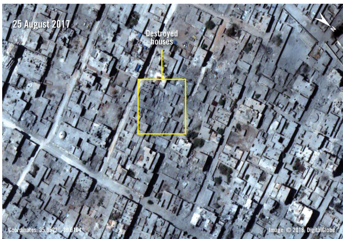
Satellite images showing the house where 28 members of the Badran family and five neighbours were killed in a Coalition strike on 20 August 2017, before and after the strike.