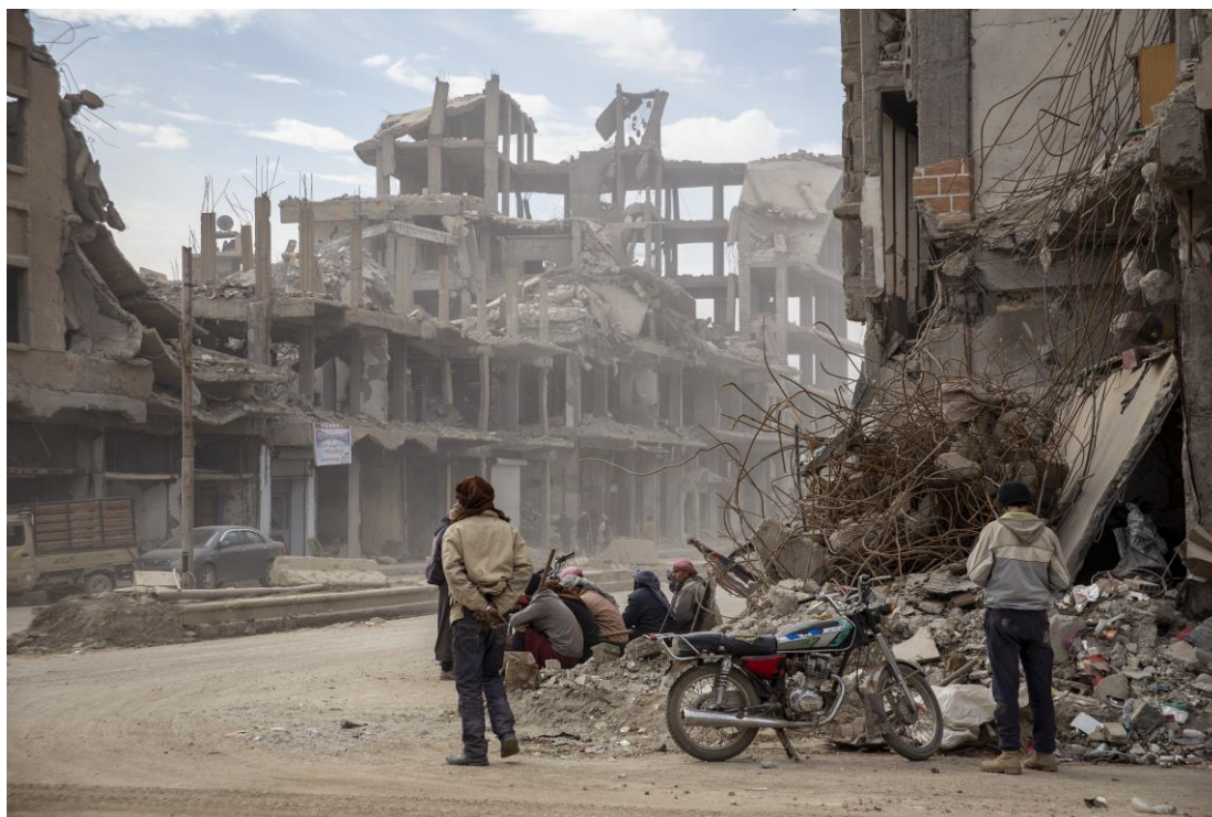
Men wait by the side of the road for casual labour in Raqqa. Many end up clearing partially destroyed or damaged buildings, a very risky endeavour as many buildings were mined by IS and civilians are frequently killed and injured by mines.