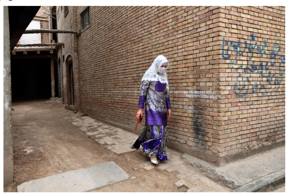
Undated photo of Uighur woman walking through an alley in the western city of Kashgar. Under the "Regulation on De-Extremification" implemented in the XUAR since March 2017, the wearing of traditional veils and headscarves can lead to punishment.

In fact, ethnic tensions in the XUAR are nothing new. For decades, many Uighurs have felt resentment towards what they see as systematic ethnic and religious discrimination in the XUAR. Promised broad autonomy under China's laws and policies, many Uighurs and other ethnic minority groups instead experience social and economic disadvantage. Though they acknowledge that government policies have led to economic development of the XUAR, they see many of the benefits of growth either flowing out of the region or going to the many Han immigrants who have been encouraged to settle in the region over the years. <sup>14</sup> On top of this is a sense of cultural alienation, as they are repeatedly being told that their traditions are backwards compared with the modernity of Chinese culture and their children receive a "bilingual education" that focuses on teaching Chinese language and Han culture at the expense of their own language and traditions. <sup>15</sup>