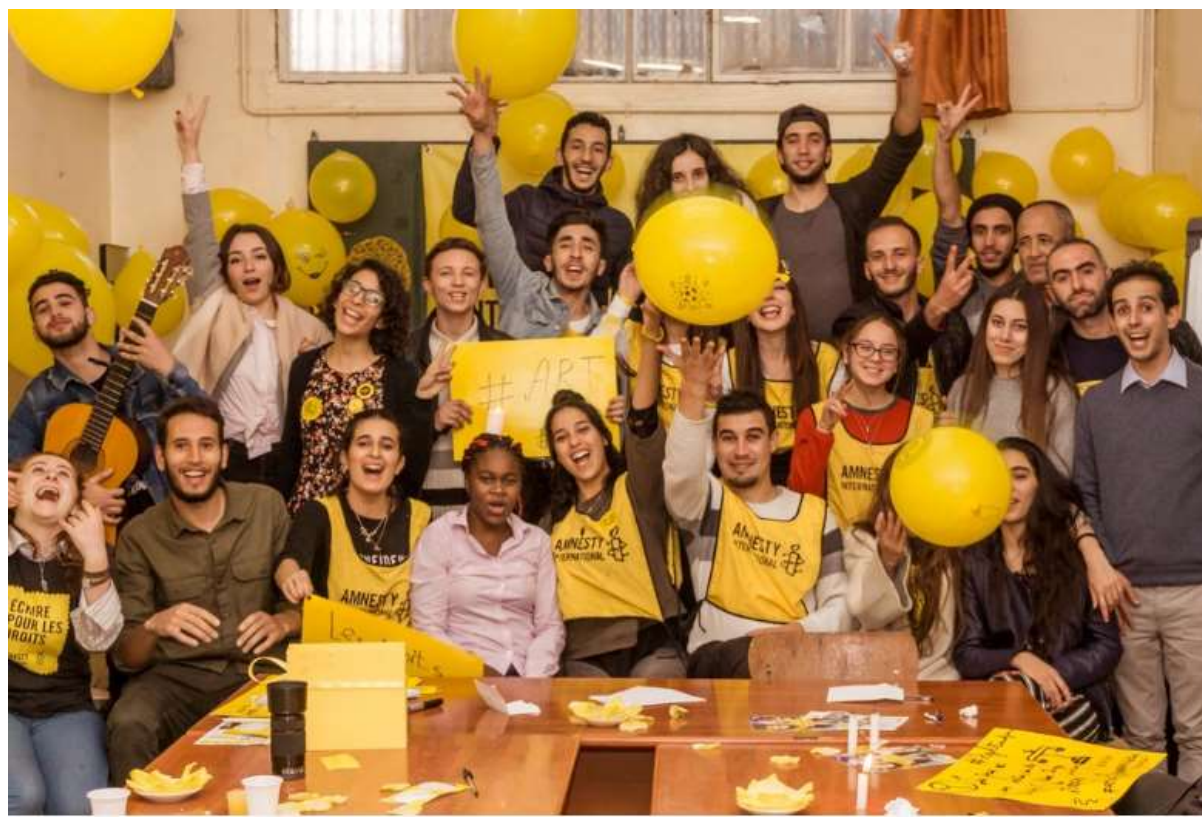
Supporters and members of Amnesty International Algeria take part in events for Write for Rights 2018, December 2018.

12 activities were conducted, in collaboration with local associations and also local authorities, "strengthen the work of collaboration with local associations" is an objective that was set during the elaboration of the guidelines of the growth and activism 2016-2019