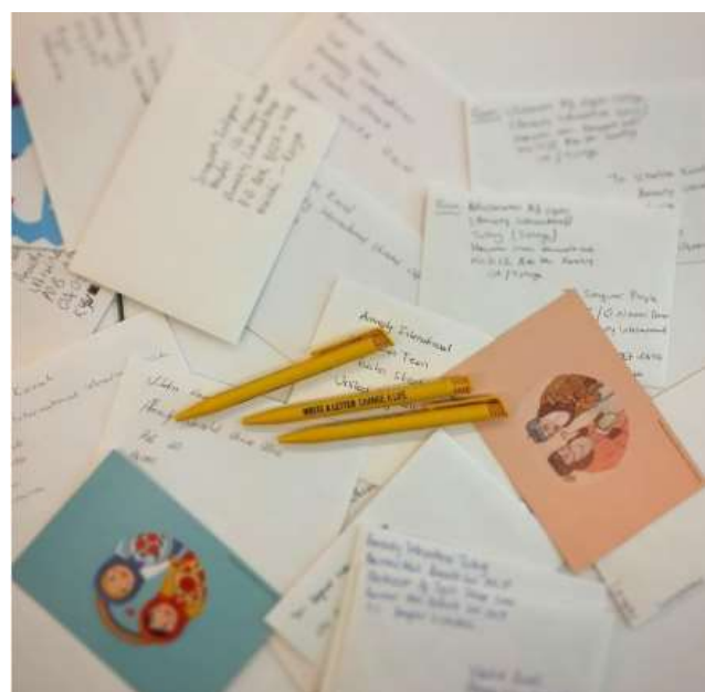
Letters written by AI Turkey for Write for Rights

Open calls were made through social media; Instagram, Facebook and Twitter and call for action mailings were sent to activists and supporters.