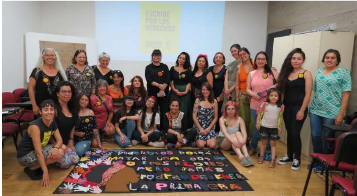
Activists take part in a Write for Rights event held by AI Chile.

Finally, thanks to the extra funds of the IS, the Section closed the campaign with the Recital Ellas Cantan for Human Rights, in which two famous Chilean singers participated free of charge, which brought together a large audience of all ages. This coincided with the commemoration of International Migrants Day, establishing interesting alliances with organizations for the rights of migrants, and holding a joint activism day that also allowed us to reach a new, larger and multicultural public.