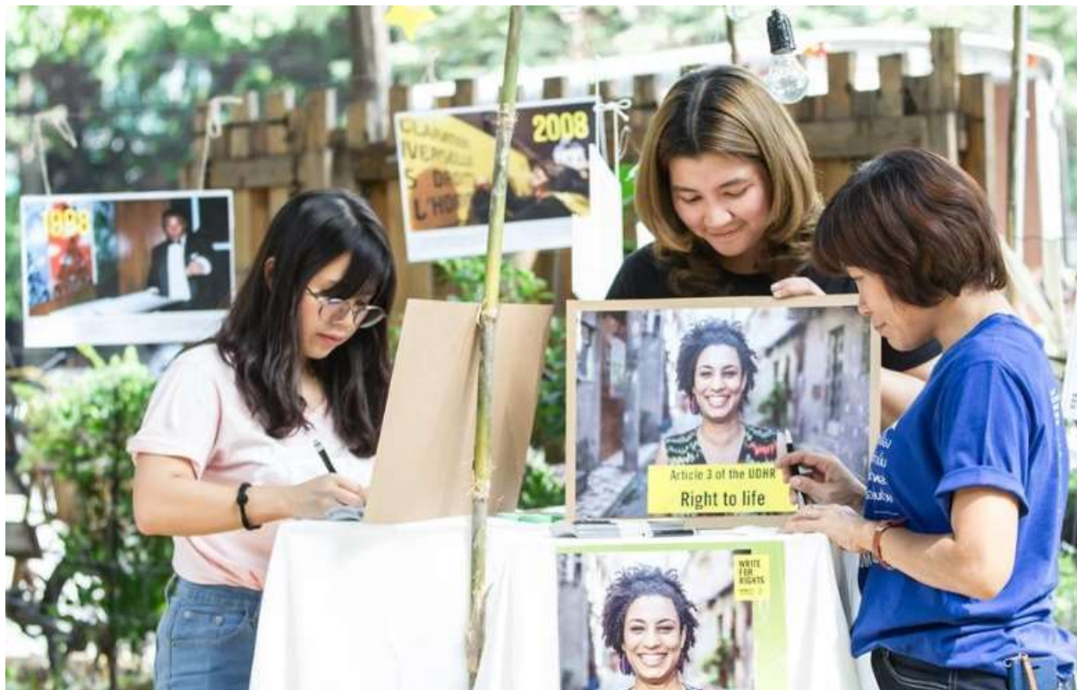
Write for Rights 2018 event in Thailand

A highlight this year was a design thinking workshop aimed at putting an innovative spin on Write for Rights. Many creative ideas were developed during the workshop. This proved a success for Amnesty Thailand in engaging with a new audience and it raised exciting opportunities for future campaigns. The section also set up booths in markets and parks, and as part of other events by Amnesty Thailand or their partners’.