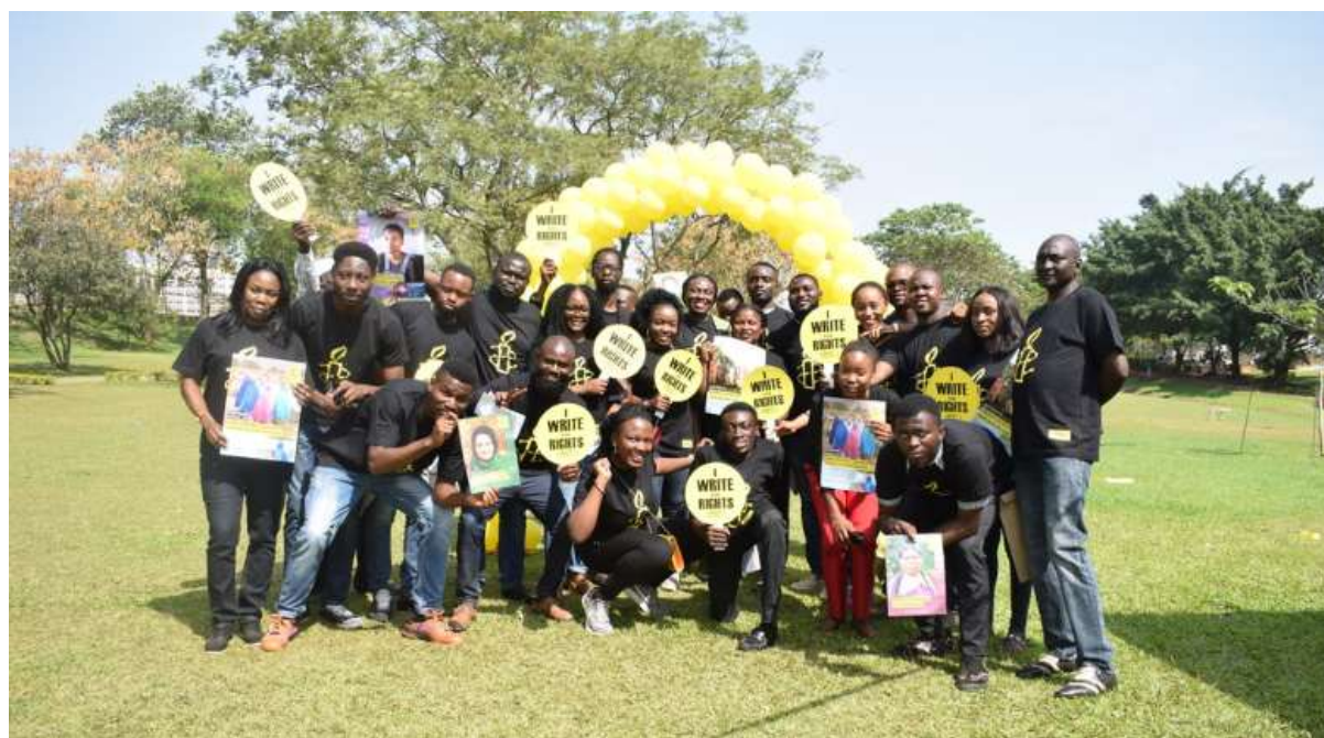
2018 Write for Rights even with AI Nigeria

Write for rights in Nigeria commenced with a national launch on 1 December. Thereafter, a total number of 23 events took place in sixteen (16) states across the country. Activists and supporters of Amnesty International in Nigeria and the public gathered in various events to write letters and sign petitions in solidarity with women human right defenders. Highlights of events ranged from friendly football matches, solidarity walks, youth neighbourhood gatherings, to write for rights action at a Nigerian law school. 10,457 actions were taken in support of cases from Kenya, Morocco, India, South Africa, Iran, and Brazil. As part of measures taken by AI Nigeria to bring Write for Rights global campaign closer to the ground in terms of national relevance the case of Knifar women was also promoted. The case gathered 3,572 actions. The facilitation of the various events across the states by coordinators of AI Nigeria supporters group was helpful in ensuring the success of the events. Collaboration with youth groups particularly the Young African Leaders Initiative (YALI Network) which is popular across Nigeria also helped. For example, in some states they offered their venues free to AIN supporters for Write for Rights. The solidarity walk in Nigeria's capital city was a first-time initiative which created more awareness and participation at the Write for Rights events.