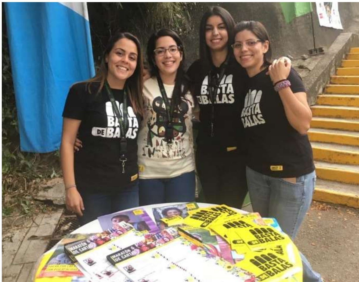
Young activists in Venezuela

The Women's Network promoted various activities, with actions carried out in different spaces such as plazas, theatres and at places like concerts, dances. The Section worked with young female influencers on social media, they supported the campaign and promoted the importance of human rights defenders and highlighted the attacks and violations faced by defenders throughout the world.