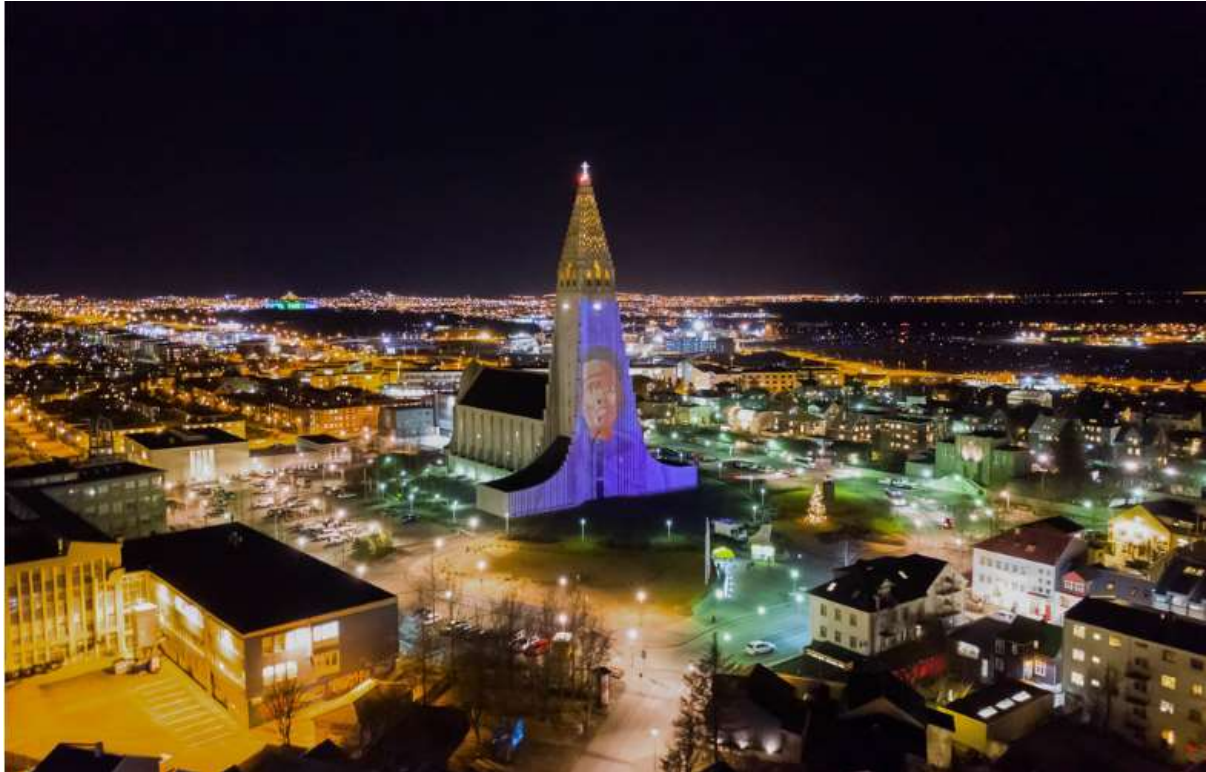
Light up the dark event in Iceland and collaboration with Icelandic Bus company

AI Iceland launched a new Write for Rights website which proved to be a great success. They saw a 16% increase in users visiting the Amnesty website this year and a 33% increase of page views. Around 60,000 signatures were collected on the website alone.