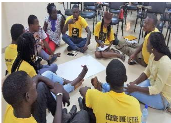
AI Burkina Faso youth members at a campaign training in Ouagadougou © Amnesty International Burkina Faso.

Members in Bobo Dioulasso organized a “Night of Human rights” in commemoration of the 70th anniversary of the UDHR. They mobilized over 150 people and used storytelling, music, drama, film projection to raise awareness about human rights and the UDHR.