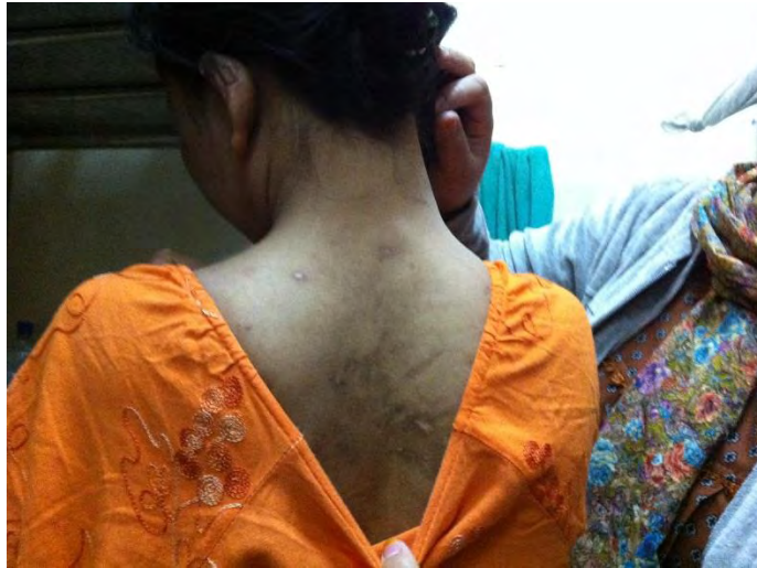
An Indonesian former domestic worker shows researchers the marks on her body that she said were inflicted by her employer.