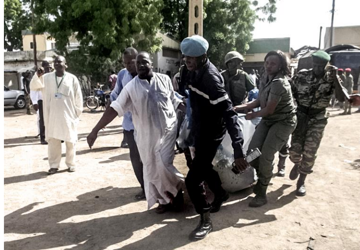
Security forces carry the remains of one of the victim of the blasts in Maroua, 22 July 2015.

"There's a truck-loading station in Barmare, where lorries get ready to travel to other markets of the region or to Chad. There were many people when the bomb exploded. I was having lunch in a small restaurant. I don't know how I was not wounded, I really thank God. After the explosion, there was panic and people were screaming. I saw at least 5 dead bodies. I helped those wounded and tried to comfort them." 133