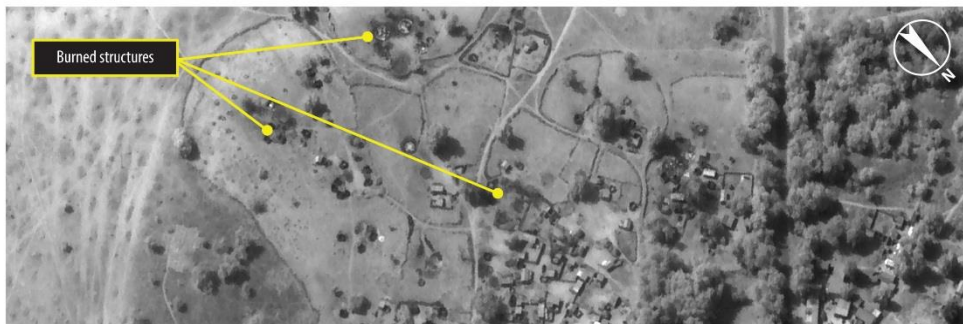
Figure 3. Imagery on December 29 shows many structures in the southwest area have been damaged or destroyed.

DigitalGlobe Panchromatic Imagery, December 29, 2014, 11.1737°, 14.2442°