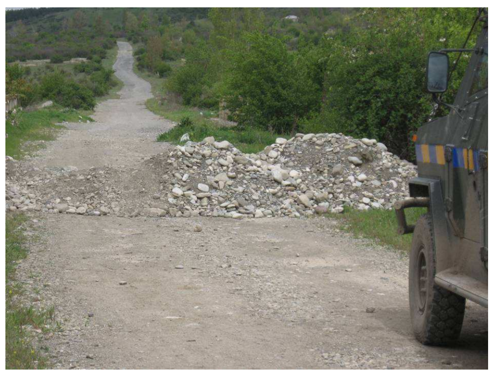
ABL demarcation on the Georgian side of the village of Adzvi.