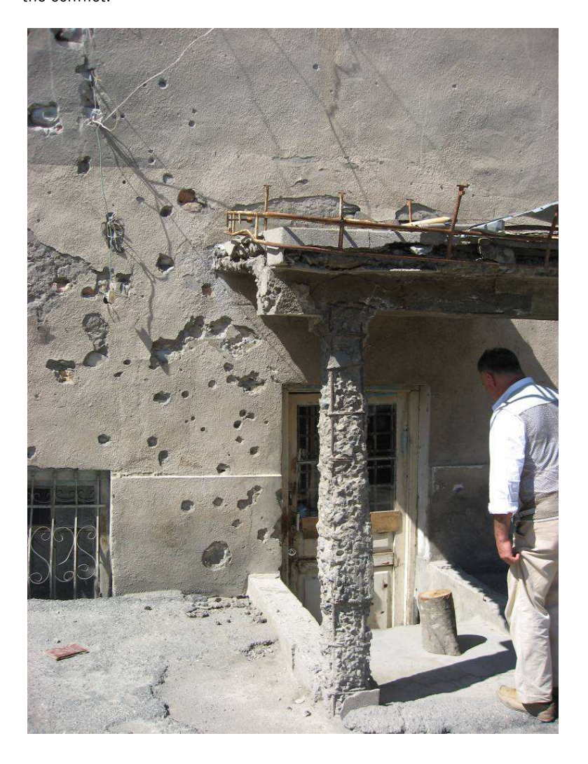
Damaged entrance to a synagogue cellar in Shaumian street, Tskhinvali, where civilians hid during hostilities in August 2008. Tskhinvali, South Ossetia, July 2009.

Information collected by Amnesty International indicates that one year after the war, civilians continue to endure human rights violations, and remain directly affected by the aftermath of the conflict.