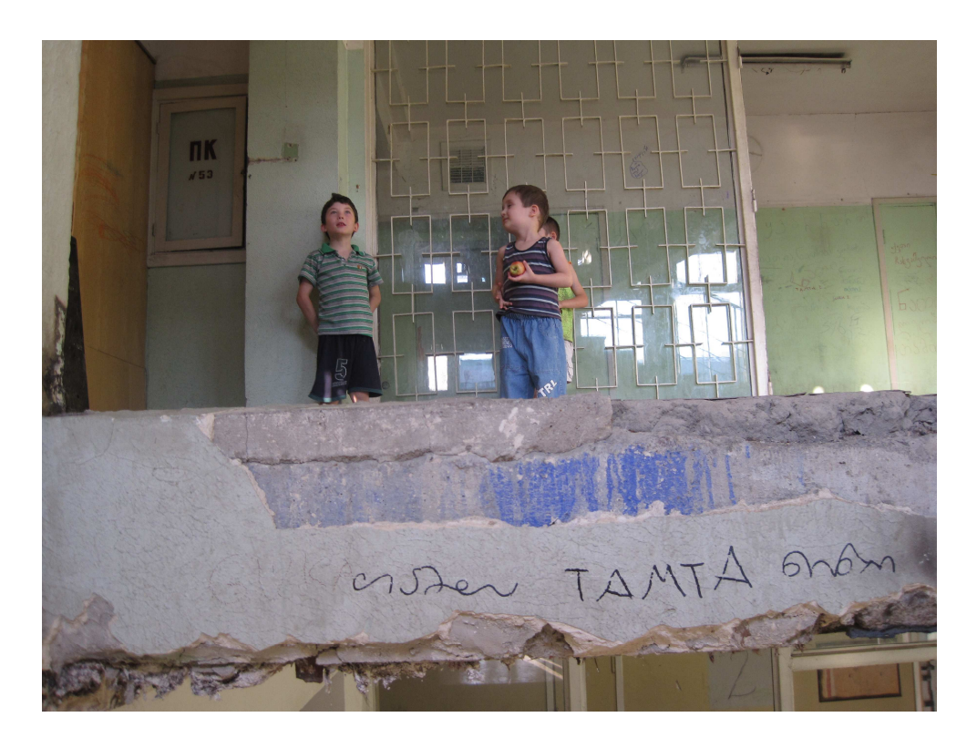
Children at a temporary accommodation centre in the former South Caucasus Headquarters of the Ministry of Defence, Tbilisi, Georgia, July 2009.

Amnesty International has previously documented the extensive destruction of various Georgian settlements in South Ossetia that occurred after the ceasefire. Other Georgianmajority villages inside South Ossetia, especially those under de facto South Ossetian administrative control in the period before the conflict, suffered less destruction.<sup>28</sup> South Ossetians who remained in the region during the conflict, or have since returned there, have reportedly not attempted to move into the houses of ethnic Georgians in the villages between Dzhava and Tskhinvali. However, there has been no effective possibility for ethnic Georgians to return to these houses.