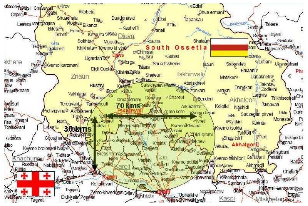
Area patrolled by the EUMM, 130 kms on the Georgian side of the ABL with South Ossetia.

In this new context of reduced capacity for monitoring and public reporting, Amnesty International therefore considers that the EU could make an important contribution by carrying out an assessment of the current monitoring needs in Georgia, with the aim of seeing whether the working practices of the EUMM could be realigned to meet the gaps that have emerged in international scrutiny. This could include inter alia trial observations, prison monitoring and human rights promotion, as well as a function of public reporting.