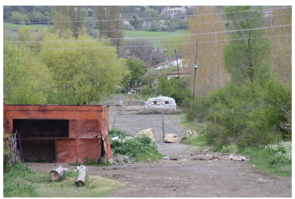
Checkpoint near the village of Knolevi.