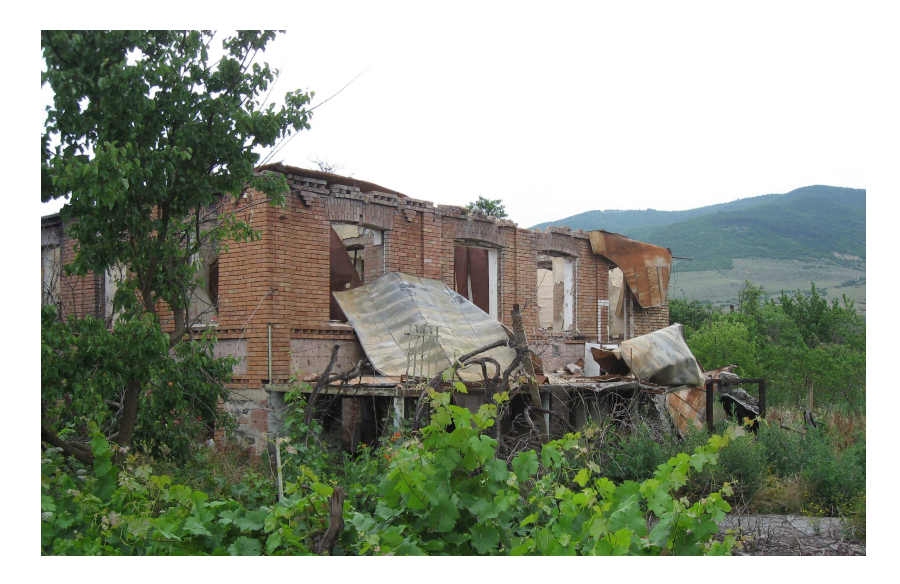
Abandoned Georgian enclave between Tshkinvali and Djava in South Ossetia, where houses were reportedly torn down and looted. July 2009, South Ossetia.