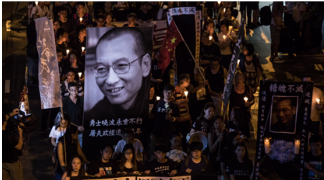
People attend a candlelight march for the late Chinese Nobel Peace Prize laureate Liu Xiaobo in Hong Kong. [2017]